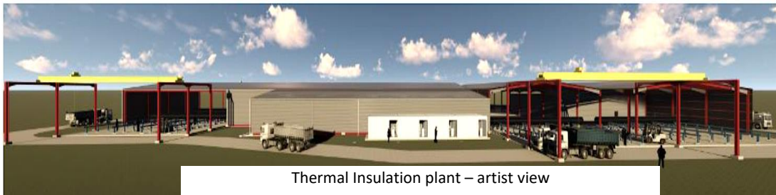
Thermal Insulation plant – artist view

The construction of the coating yard is being executed by two EACOP Contractors: MILEMBE, a Tanzanian Civil Engineering company responsible for earth works and WASCO ISOAF Tanzania, together with its partner FABEC who are erecting and outfitting the thermal insulation plant, as well as the camp and pipe storage area. These activities have given opportunities to the local labour market, to date some 22 people from the four villages around the area having been given work by Milembe and a further 21 by WASCO ISOAF.